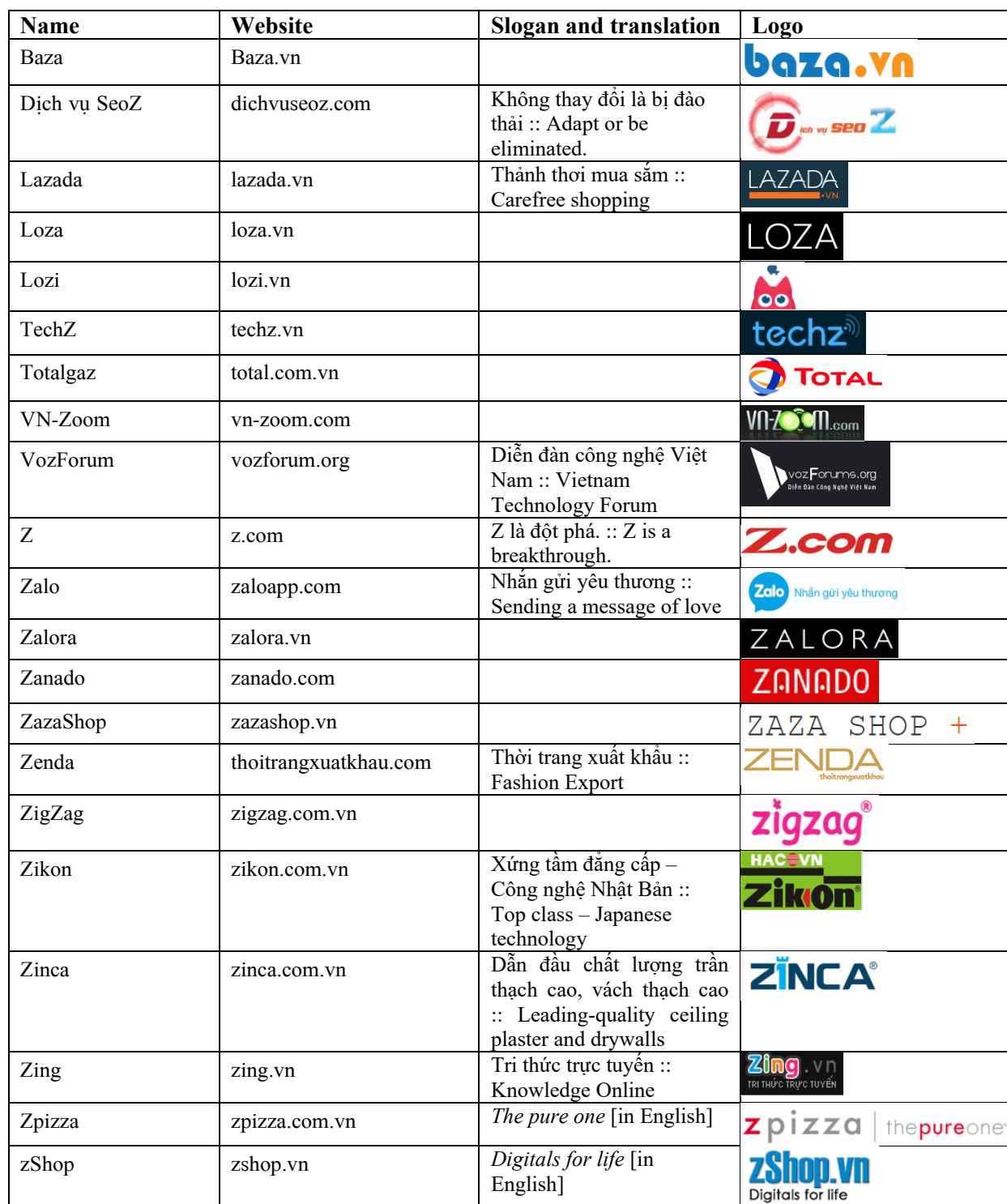
Table 1: A list (in alphabetical order) of popular websites whose address contains the letter Z.

A special case is that of companies named “Z”. The company Z Pizza , boasting no less than three Zs in its name, ( http://zpizza.com.vn/ ) has a supersize announcement – an eye-catcher in a cityscape where ads remain few – on the walls of the shopping mall Vincom Center Ba Trieu. At its opening in 2004, this high-notch shopping mall was the tallest building in Hanoi; as a Vietnamese-owned private company, it is a symbol for aspiring entrepreneurs and young professionals. The message displayed on the advertisement is “Thương hiệu đến từ Mỹ” ( An American trademark ), emphasizing that the company delivers the real thing, as if straight from the USA.